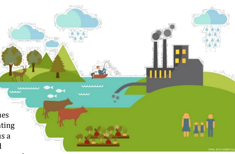
Figure E.2. Examples of radiation pathways

People can be exposed to radionuclides in the environment through a number of routes, as shown in Figure E.2. Potential routes for internal and external exposure are referred to as pathways. For example, radionuclides in air could be inhaled directly or could fall on grass in a pasture. If the grass were then consumed by cows, it would be possible for the radionuclides to impact the cow's milk, then the people drinking the milk. Similarly, radionuclides in water could be ingested by fish, and fishermen or other consumers could then ingest the radionuclides in the fish tissue. People swimming in the water also would be exposed. Exposure to ionizing radiation varies significantly with geographic location, diet, drinking water source, and building construction.